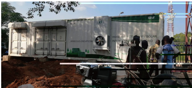
Figure 1: Project Photos